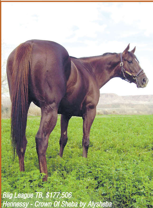
Big League TB, $177,506 Hennessy - Crown Of Sheba by Alysheba