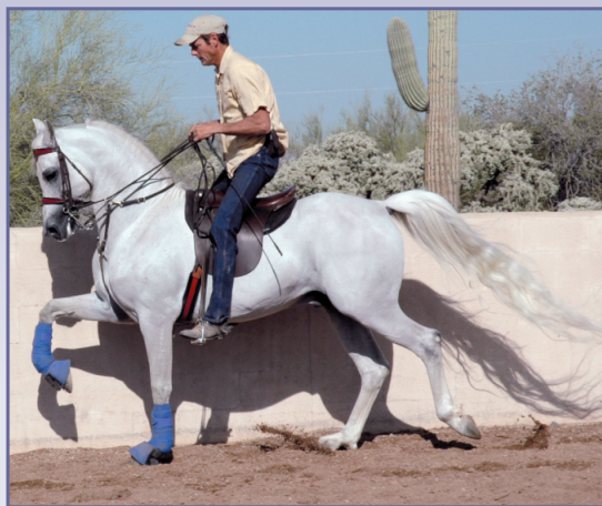
SIZZLE (Revelry x *Bandos granddaughter)